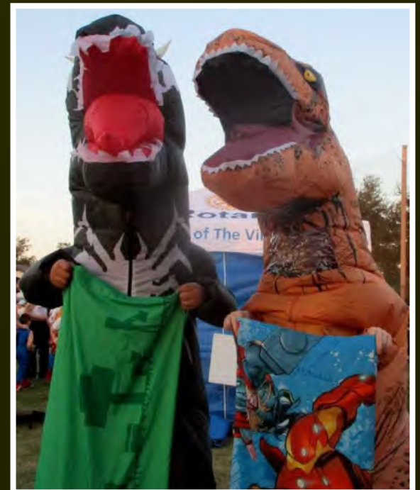
We helped Lady Lake celebrate Halloween with a Pizza Party on October 26th.