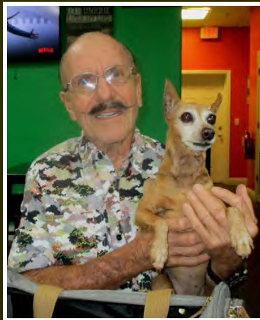
Members and friends gathered at Island Scoops for some good ice cream on September 18th.