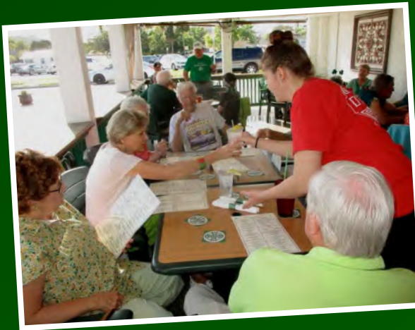
March 13th had KOTR in Tavares at O'Keefe's for our St. Patty's Day feast.