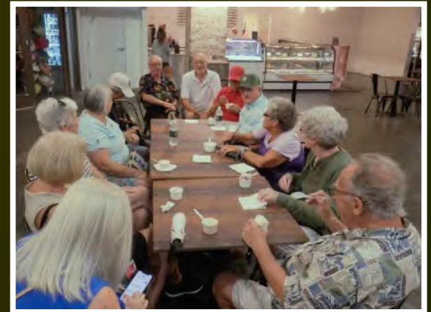
A few but hungry for ice cream fans at Darlin's Ice Cream Shop in Sawgrass Grove on August 28th.