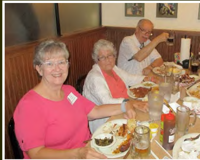
Once again the KOTR faithful enjoyed dinner at Oak Wood Smokehouse on September 26th.