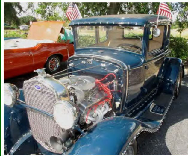
JL Trunnell's 1931 Ford hot rod at the Summerfield Suites show on June 14th.