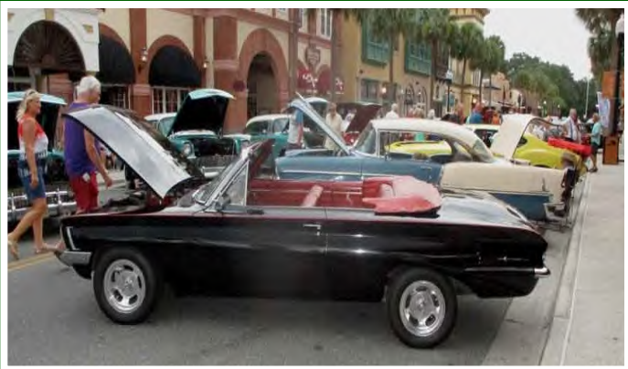
KOTR had 16 cars on display as the feature car club at the May, Spanish Springs Cruise in,