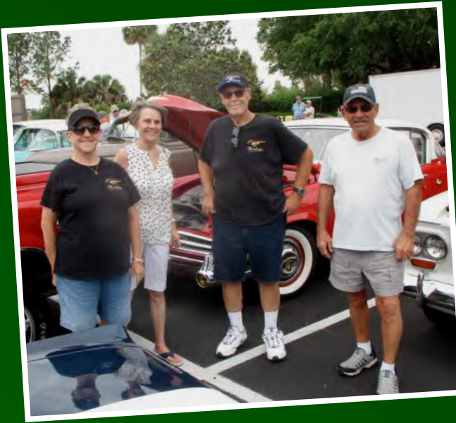
Some of our gang waiting for us to go in for the Brownwood showcase Show on April 27th.