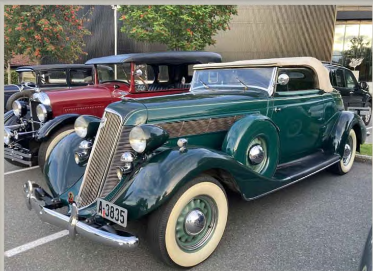
Above is a 1935 Studebaker President from Norway.