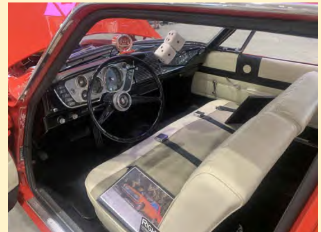
Below is a shot of the original interior. "Big Daddy" Don Garlits signed the glove box door for me.