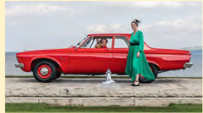
Above we are on the award platform at Cobble Beach concours along with "Hoochi mama" on my lap.