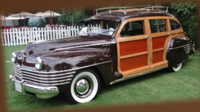
1942 Chrysler Barrel Back

A modest return to the woodie occurred in the 1960s thru the 1980s with "faux woodgrain." But the grandeur was gone and soon faded into history. Today it is but a memory for the "boomer generation."