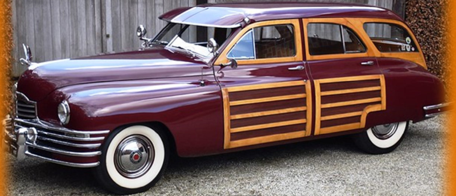
1950 Packard Station Sedan