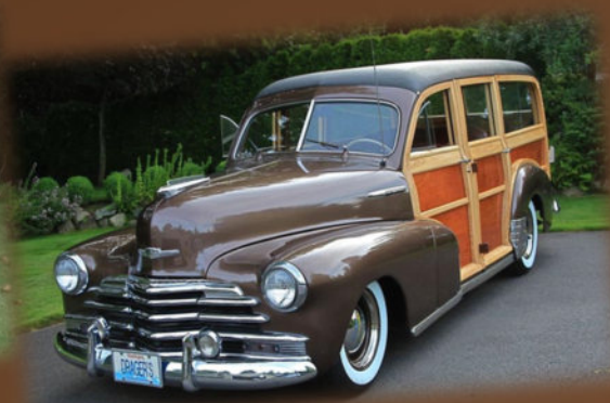
1947 Chevrolet Fleetmaster Wagon