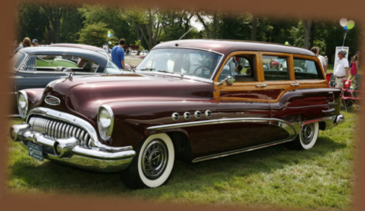
1953 Buick Roadmaster Estate Wagon