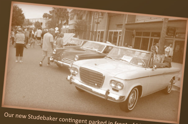
Our new Studebaker contingent parked in front of McAlister's